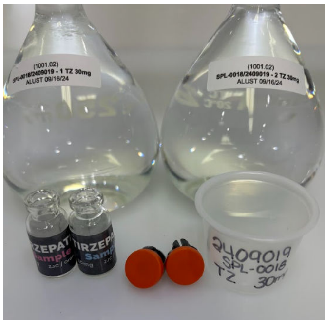
Attachment for SPL-0018 Filename: SPL-0018.PNG