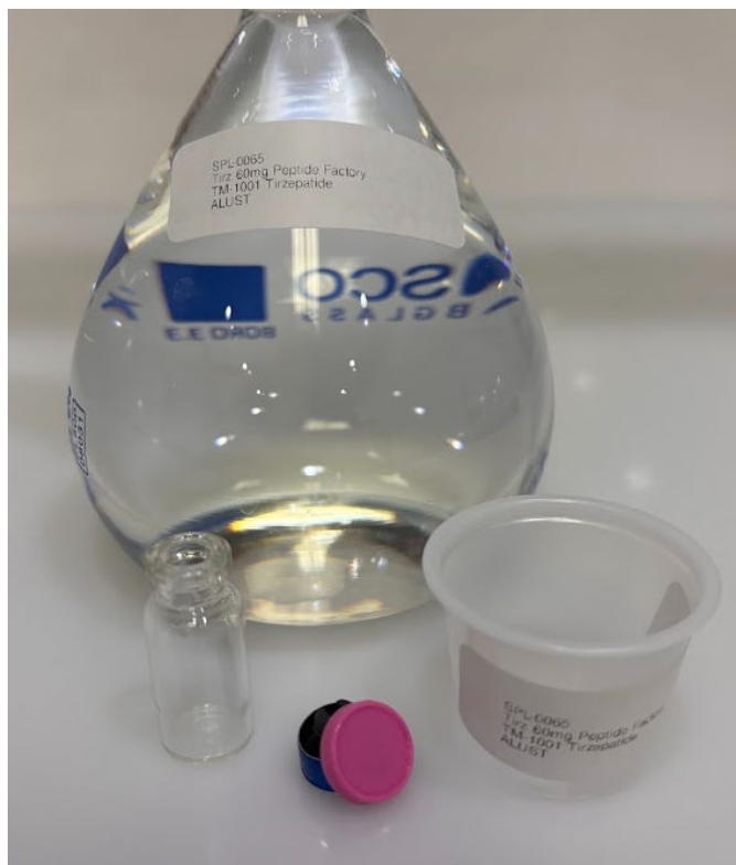
Attachment for SPL-0065